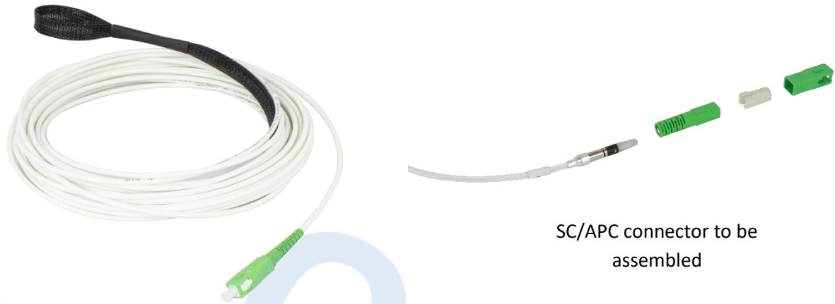
SC/APC connector to be assembled

Description 9/125 G.657.A2 single-fiber cable, LSZH jacket, Cca, preterminated with SC/APC connectors